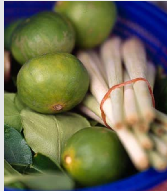
Soup / Tom kha chicken