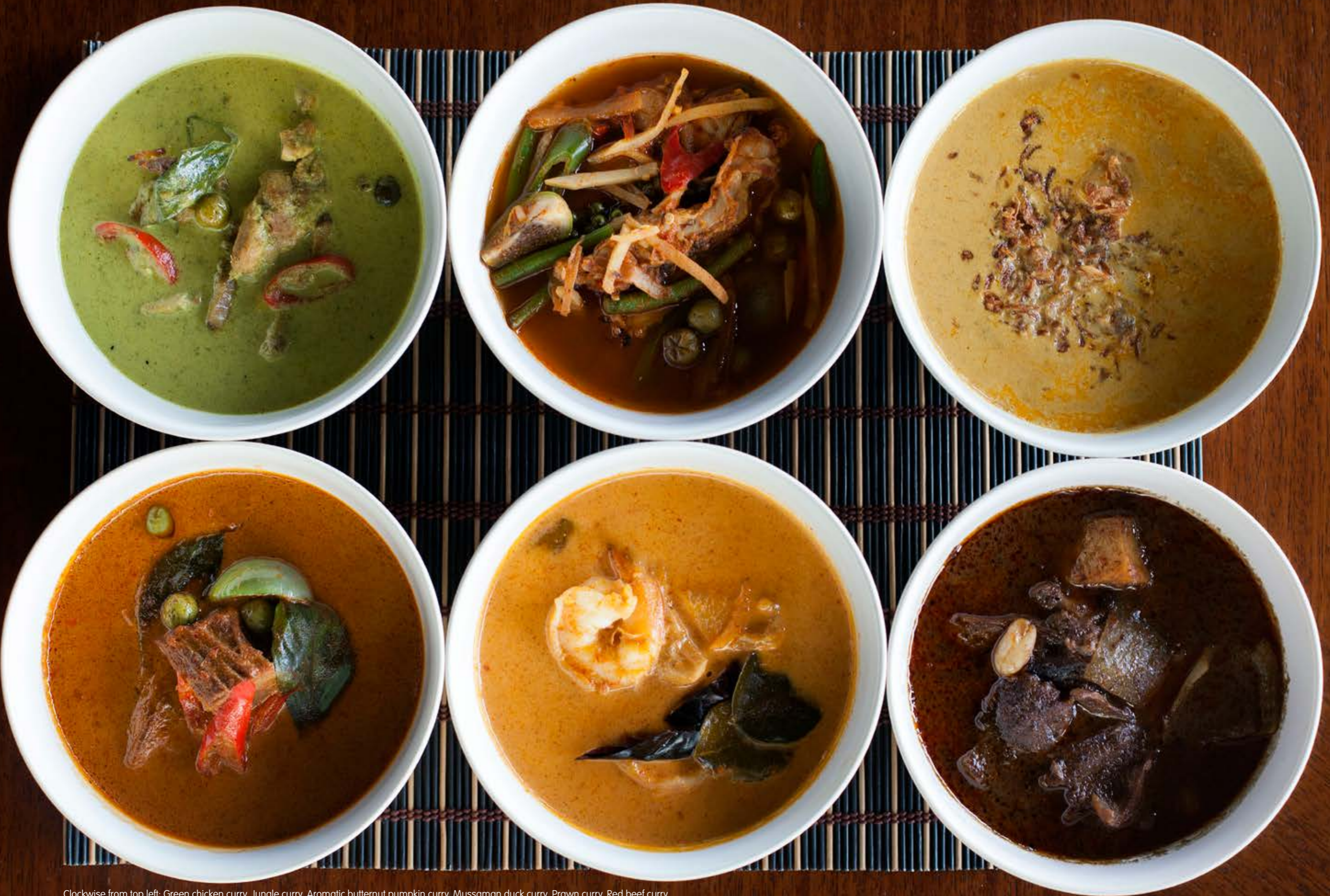
Clockwise from top left: Green chicken curry, Jungle curry, Aromatic butternut pumpkin curry, Mussaman duck curry, Prawn curry, Red beef curry