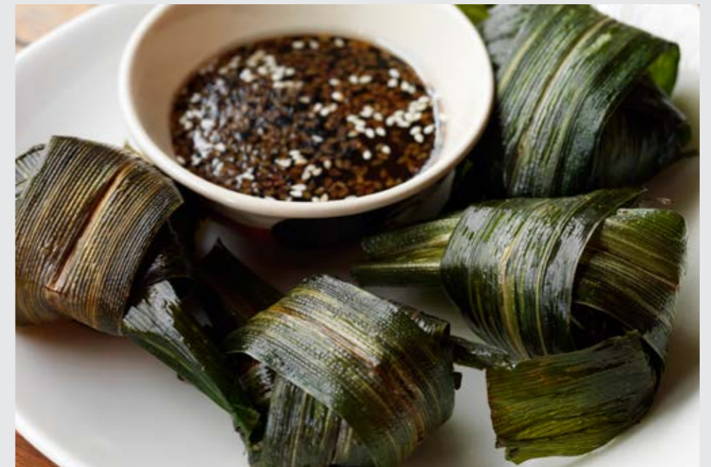
Sides / Pandan chicken