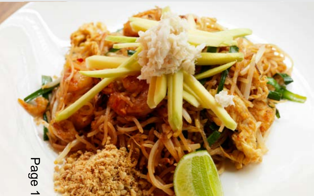
Wok noodle / Sen chan pad Thai