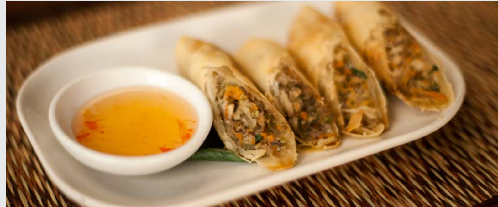
Side / Por-pia jay