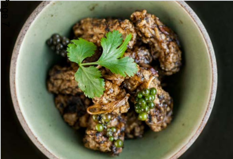
Side / Thai calamari