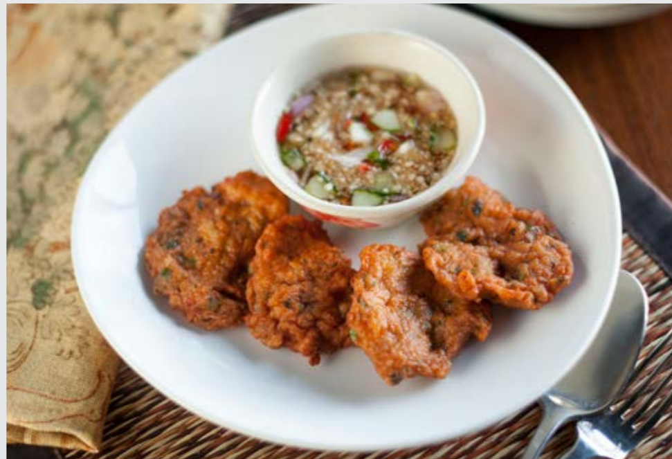
Side / Fish cakes